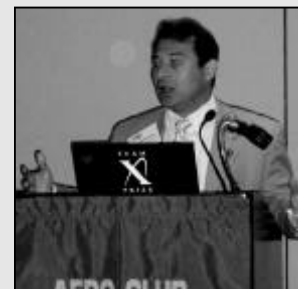
JULY — DR. PETER DIAMANDIS SPOKE ABOUT THE X-PRIZE AND PUBLIC SPACE FLIGHT BEFORE THE JULY GATHERING OF THE AERO CLUB.